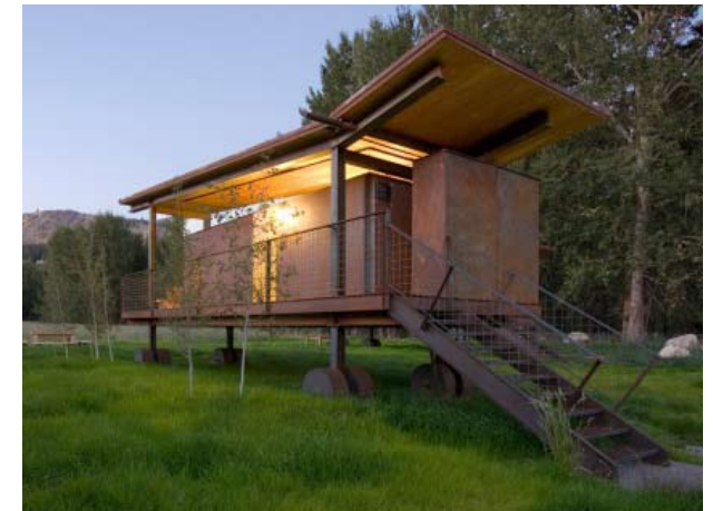
Rolling Hut, Mazama, WA Olson Kundig Architects