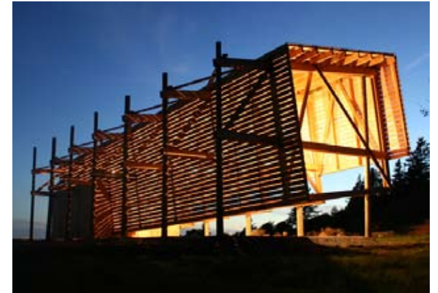
Ghost 9, Nova Scotia, Canada MacKay-Lyons Sweetapple Architects