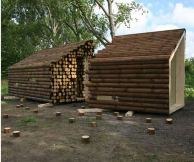
Flake Retreat, Frossy, France Olga Architects