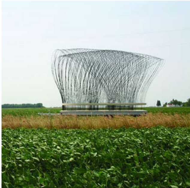
Mobile Chaplet, Fargo, ND Moorhead & Moorhead