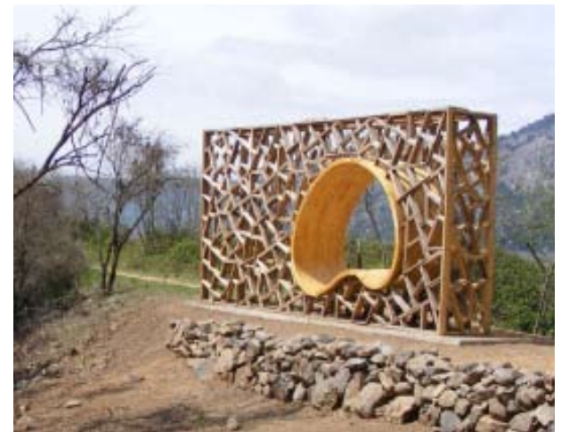
Way Station, Talca, Chile Talca School of Architecture