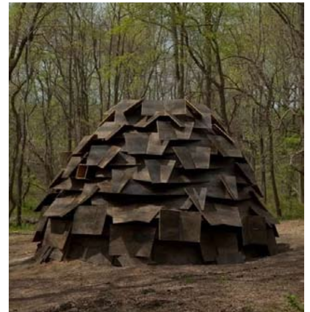
Rainshelter, Philadelphia, PA GCArchitects