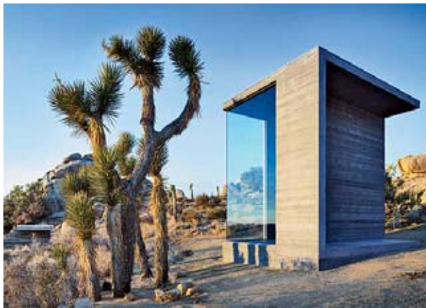
Obscured Horizon, Mojave, CA Atelier Arata Isozaki