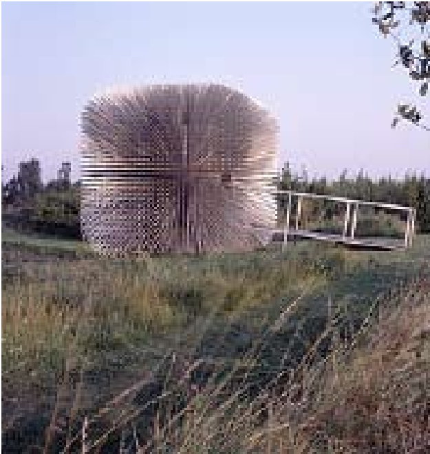
Sitooterie II, Essex, UK Heatherwick Studio