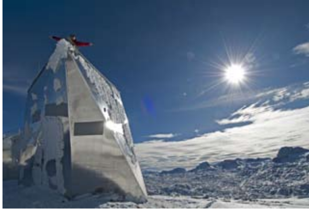
World Heritage Helix, Hallstatt, Austria Wallmann Architekt