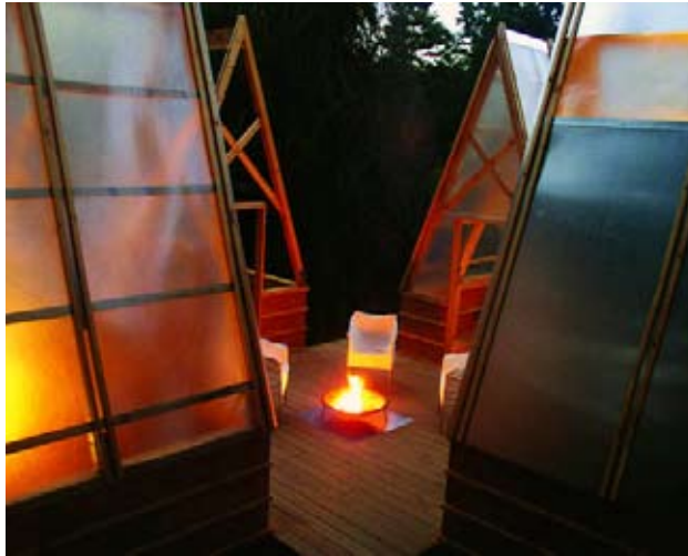
Swamp Hut, Newton, MA Moskow Linn Architects