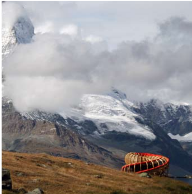
Evolver, Lausanne, Switzerland