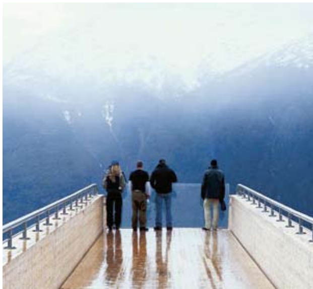
Look Out Platform, Aurland, Norway Saunders Arkitektur & Wilhelmsen Arkitektur