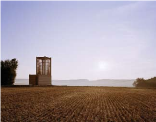
Field Chapel, Boedigheim, Germany Illinois Inst. of Technology & Ecker Architekten