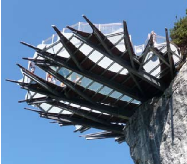
Waldring Skywalk, Tyrol, Germany Wallmann Architekt