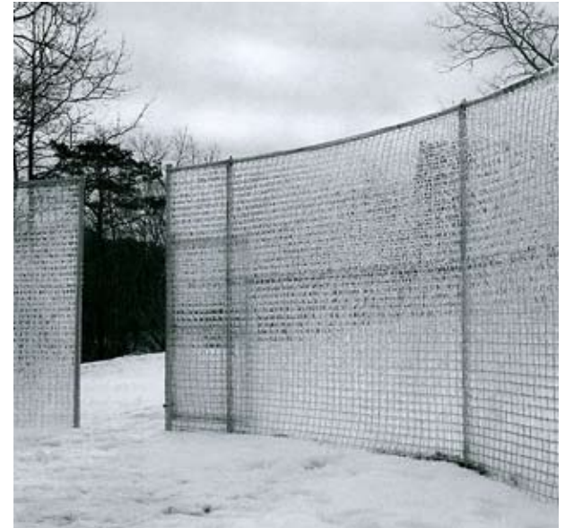
Ice Walls, Martha's Vineyard, MA Michael Van Valkenburgh Associates Inc.