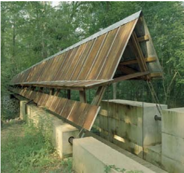
Perry Lakes Park Covered Bridge, Marion, AL Rural Studio