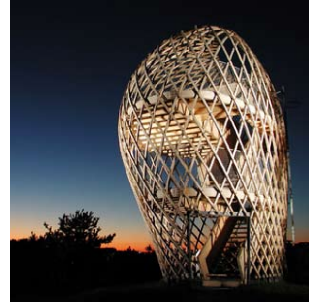
Observation Tower, Helsinki, Finland Avanto Architects