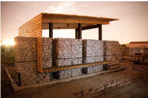
Sustainable Urban Farm Building, Denver, CO Studio HT